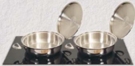
BIB-2-2000N (2 Heating zones)