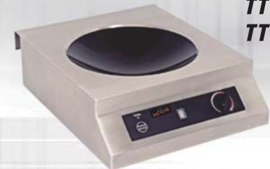
TTW-2500/ TTW-3500/ TTW-5000N