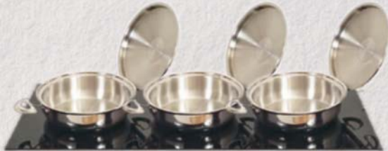
BIB-3-2000N (3 Heating zones)