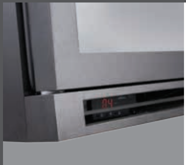
Style ventilation opening at the bottom (DBC models only)