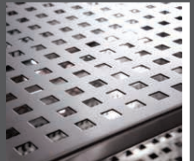
Adjustable perforated 304 grade stainless steel shelves