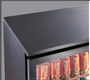
304 grade black no.4 finish stainless steel table top (DBC models only)