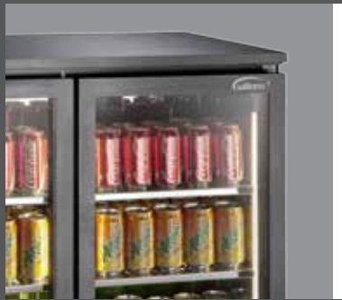
Anti-condensation double layers ultra-clear and toughened glass door with heated film