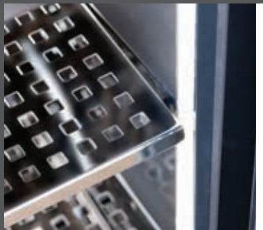
Bright, warm white (2700K) LED lighting with on / off switch